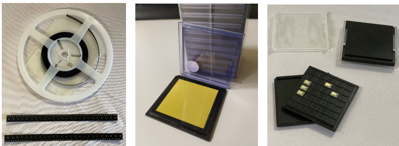
Figure 3: From left to right, tape and reel on top plus cut tape on bottom; a gel pack with transparent cover; a waffle pack with pockets inside, its black cover, a clip and a completed waffle pack.