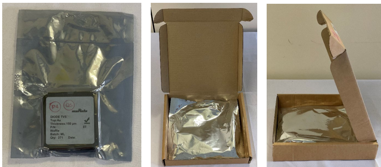
Figure 4: From left to right, a waffle pack inside a sealed conductive bag; a conductive bag for tape and reel inside its cardboard transportation box; the same box for side view.