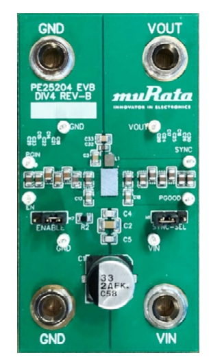
Figure 3. PE25204 Evaluation Kit